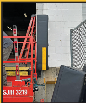
Easy and quick one person installation.