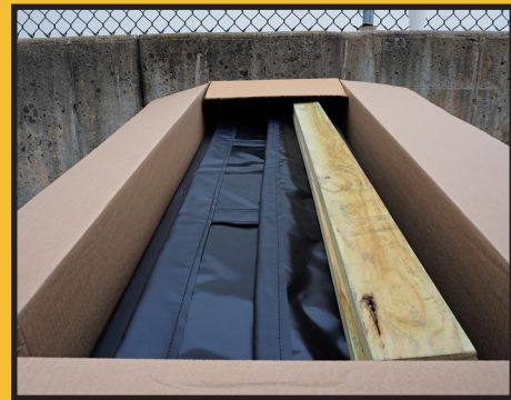
Ships in stackable five-foot box.