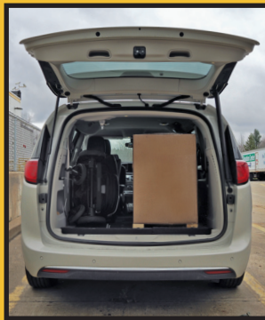
Fits into back of standard mini-van.

Triple savings on shipping, installation, & lifetime service!